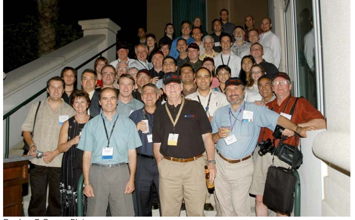
Region 7 Group Picture