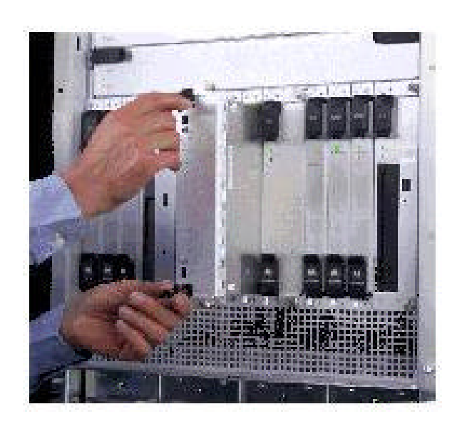
The SuperNode Data Manager Switch from Nortel Networks and Motorola Canada